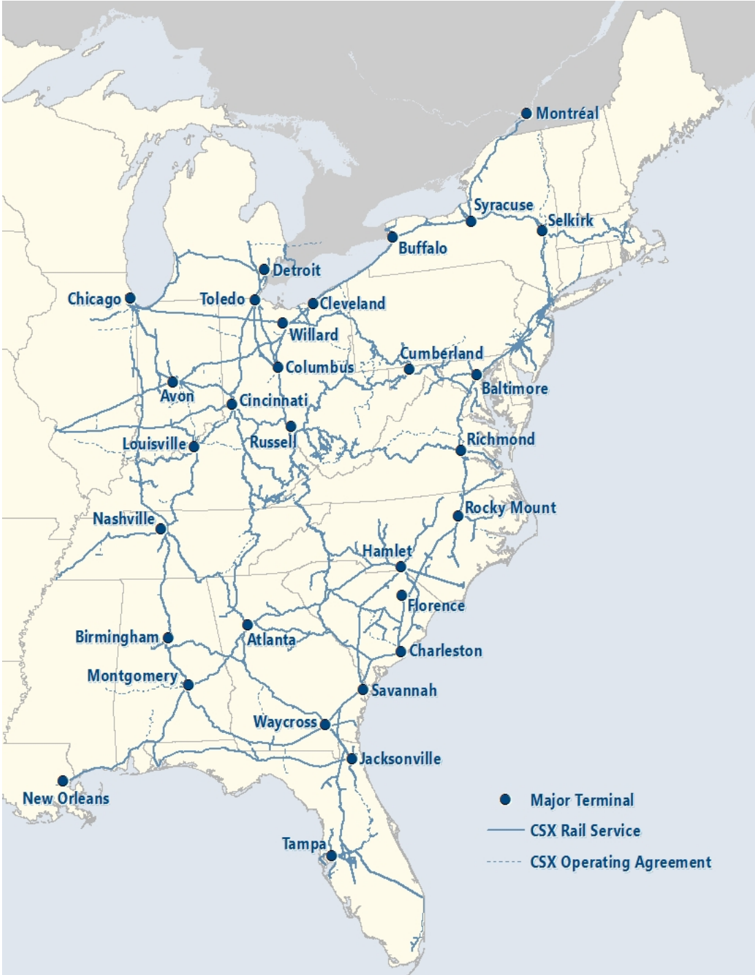
CSX Rail Network