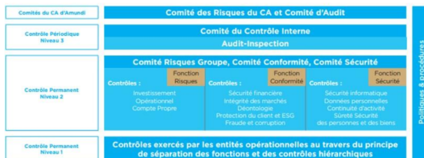
Schéma du dispositif de contrôle interne

The table below details the internal control system implemented by Amundi.