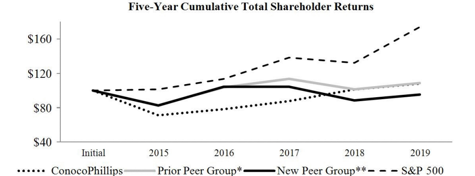
*Prior Peer Group: BP; Chevron; ExxonMobil; Royal Dutch Shell; Total; Apache; Devon, Marathon Oil Corporation; Occidental. **New Peer Group: Chevron; ExxonMobil; Apache; Devon; EOG Resources; Hess; Marathon Oil Corporation; Noble Energy; Occidental.