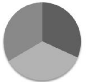
Sales Tonnes by Segment

■ Phosphates 30% ■ Potash 32% ■ Mosaic Fertilizantes 33%